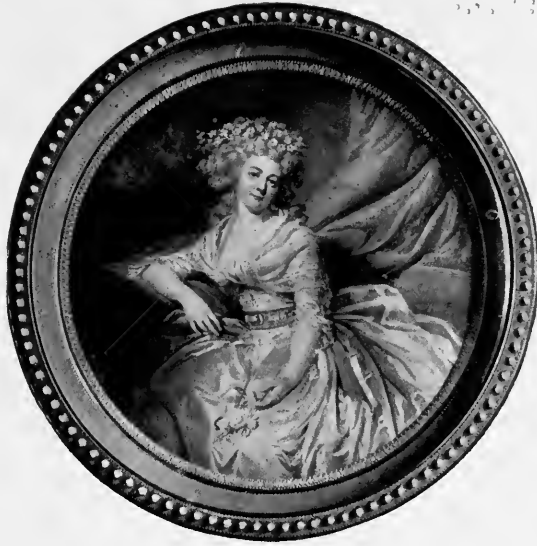
MADAME DE BOUFFLERS (1725-1800) BY J. B. JACQUES AUGUSTIN